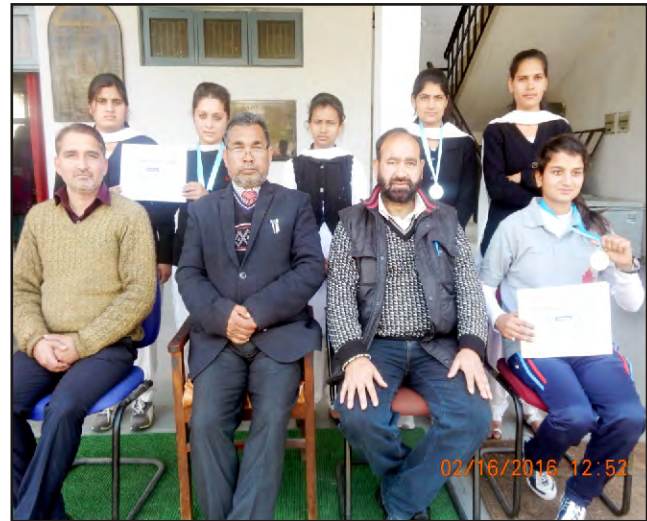
TABLE TENNIS [29-01-16 to 01-02-16]: