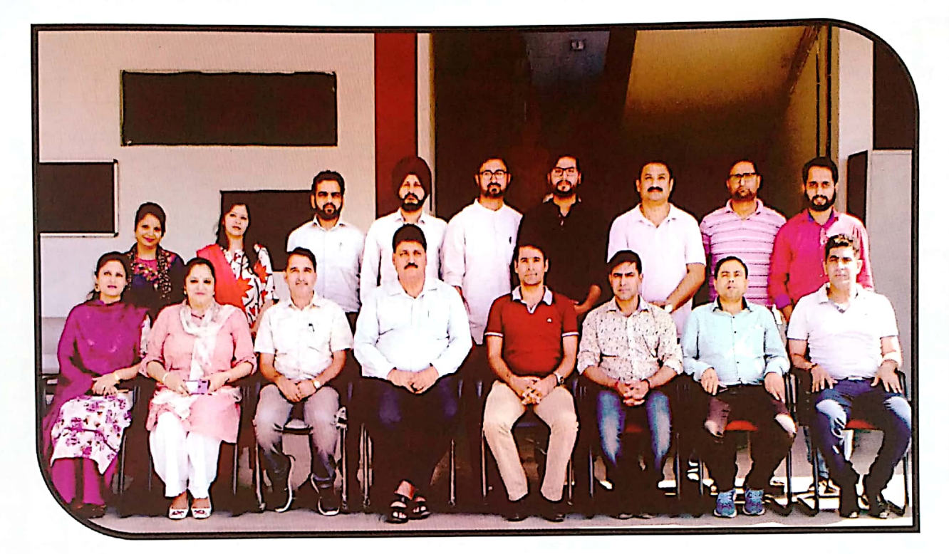
PRINCIPAL WITH TEACHING STAFF