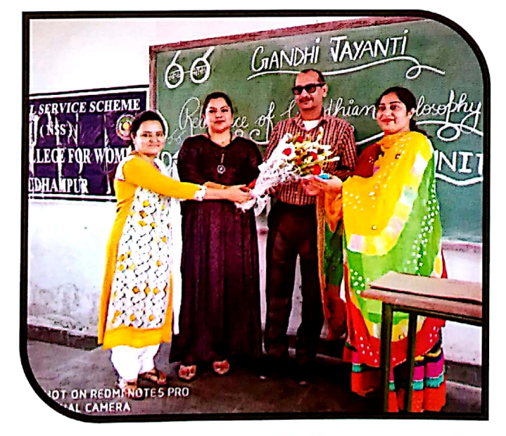
Symposium on Relevance of Gandhian Philosophy