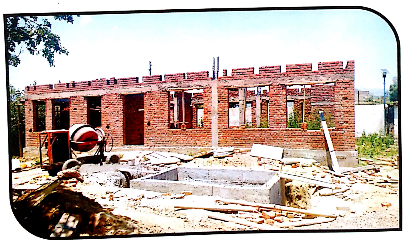
College Canteen is Under construction