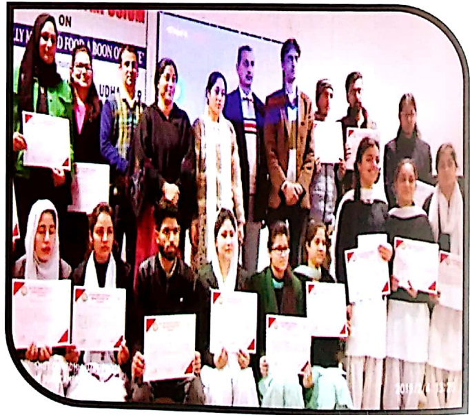
Symposium on Genetically modified food