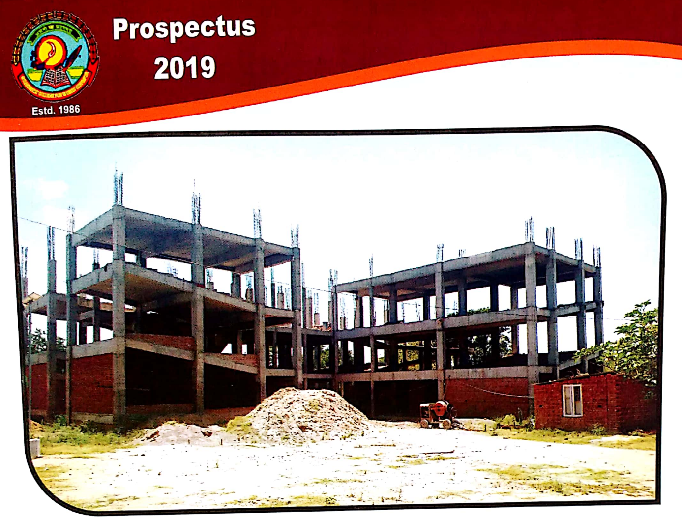
12 Classrooms building is Under construction