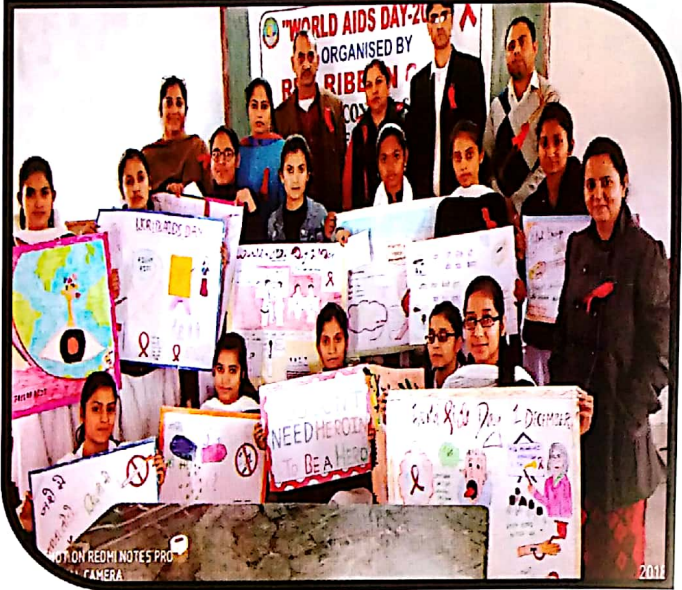
Poster Making Competition on World Aids Day